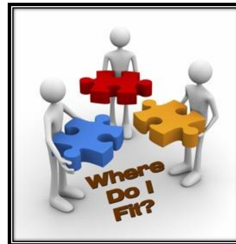
A Report from the Ministries Team